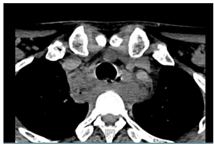
Figure 3. CT scan of the Mediastinum showed air fluid