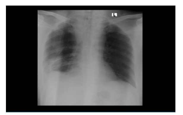
Figure 1. Chest X-ray showed widening of the mediastinum